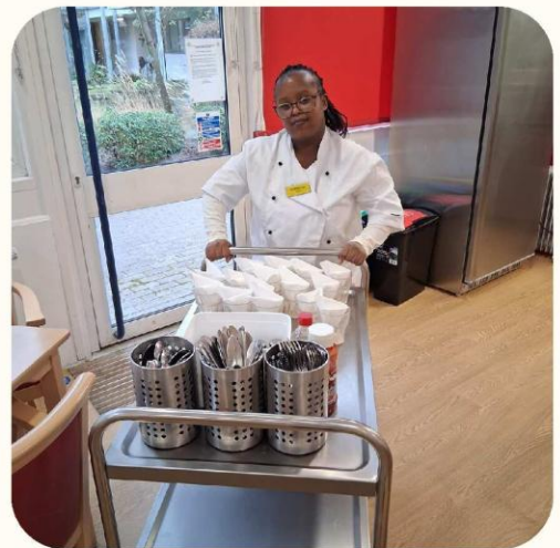
Merton Council Supported Internship