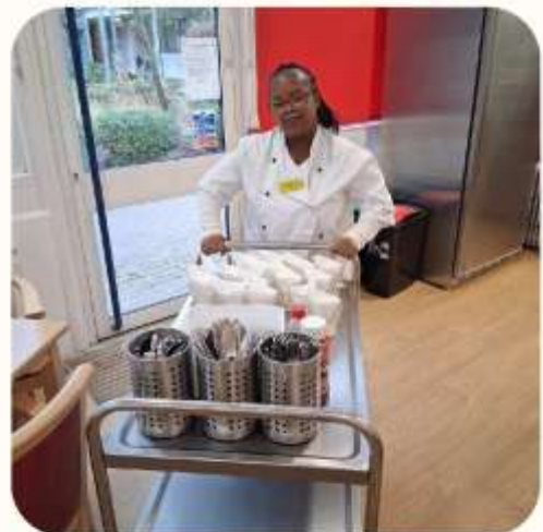
Merton Council Supported Internship

15TH MERTON COUNCIL COUNCIL CHAMBER APRIL CIVIC CENTRE 2026 MORDEN SM4 5DX