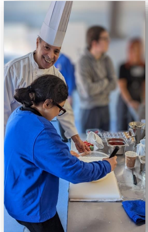
"Fun", "Amazing", "Happy" Student feedback, Strathmore School

Thank you for coming to Strathmore School! The students really enjoyed your knowledge, experience, and attitude. You were all very friendly and very supportive to all our students. - Teacher, Strathmore School